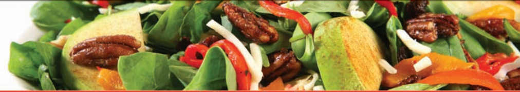
Apple Cinnamon Pecan Salad