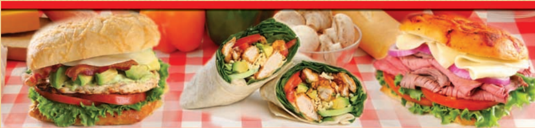
Chicken & Avocado Club