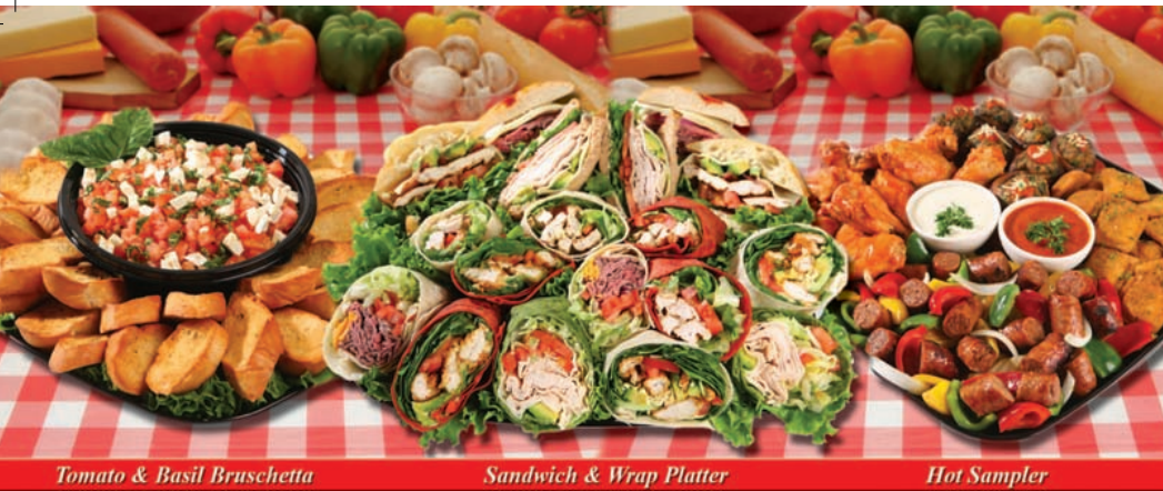
Tomato & Basil Bruschetta