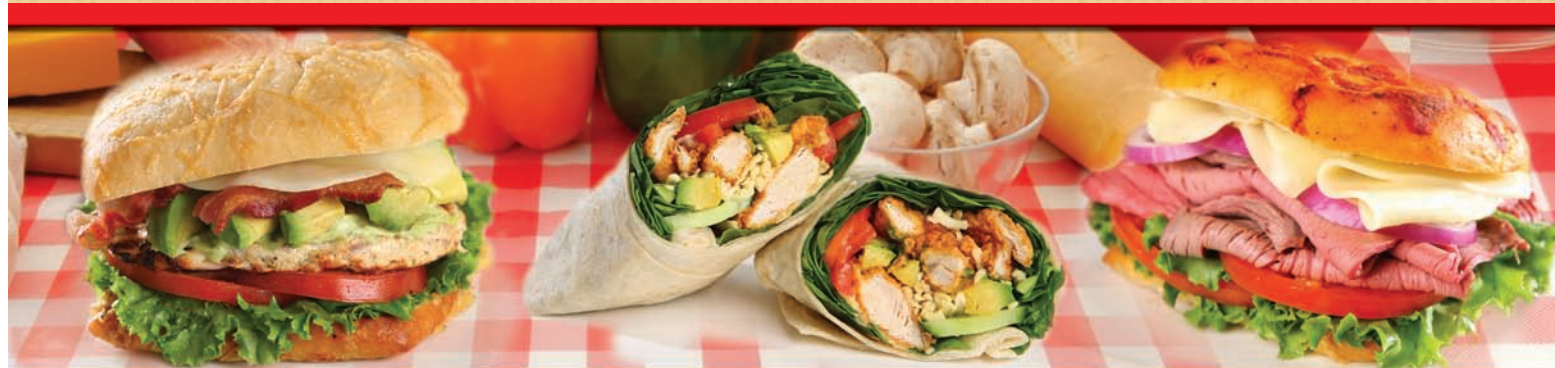
Chicken & Avocado Club

Grilled chicken, crispy romaine lettuce, bruschetta tomatoes, Caesar dressing and Asiago cheese rolled in a pita.