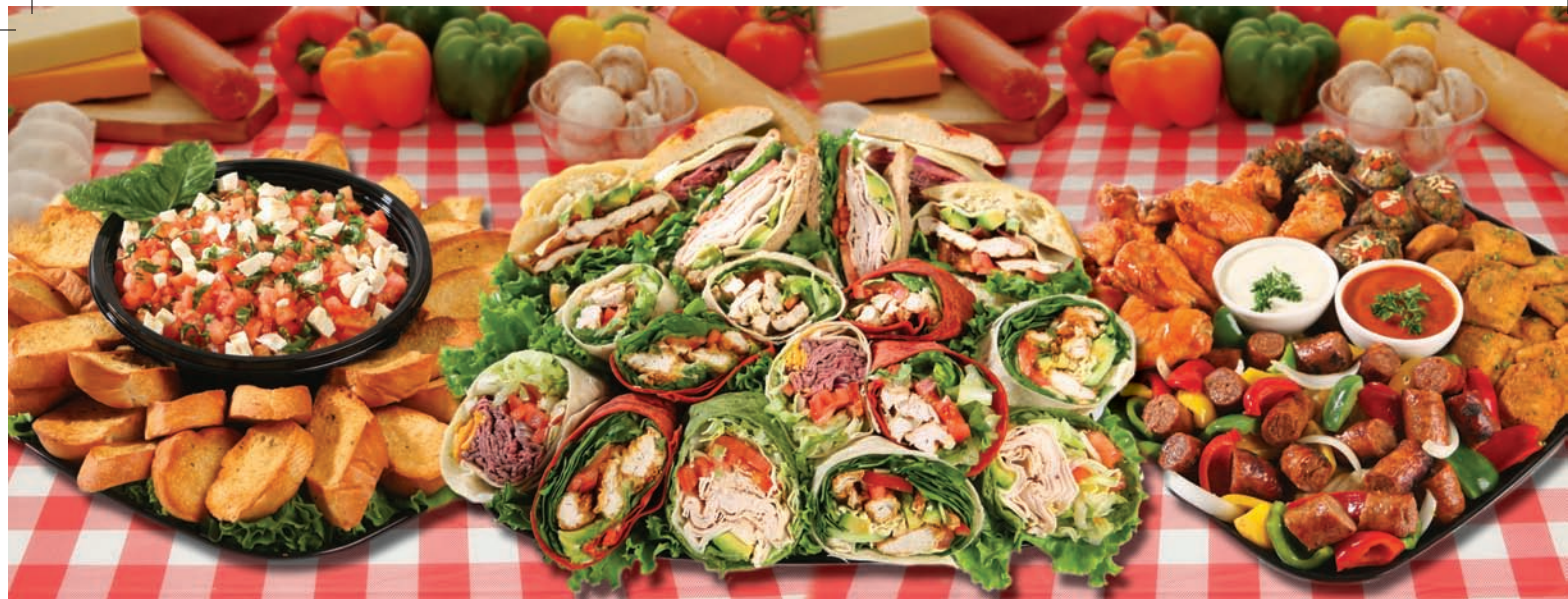
Tomato & Basil Bruschetta