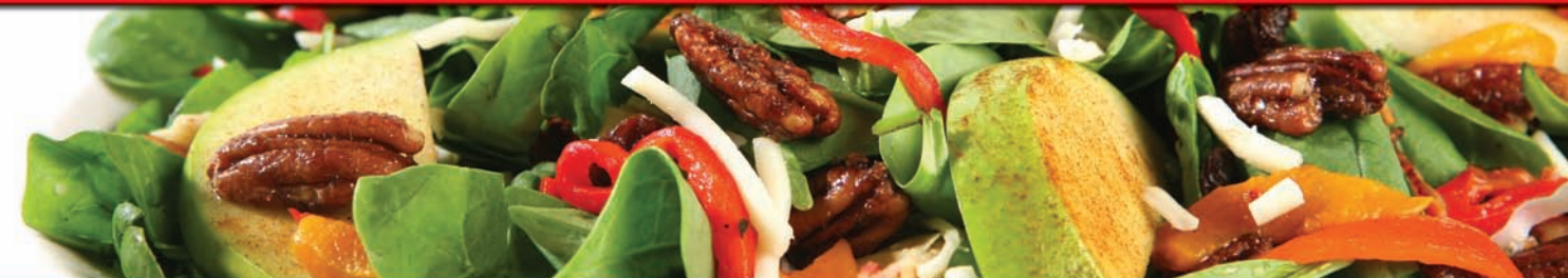
Apple Cinnamon Pecan Salad